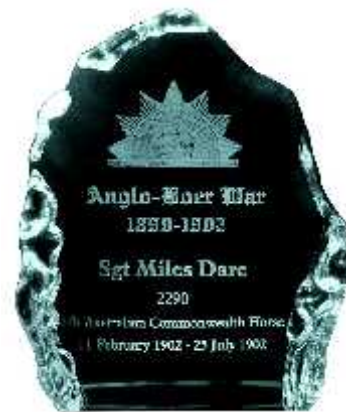
Clear Crystal Glass Memorial—Laser Etched 130mm X 155mm X 30mm....Weight 880 grams In lined presentation case. (Image has been shown with dark background to highlight engraving. Please provide details below with order. Can be supplied without badge or with the April 1902 pattern ACH Badge instead of that shown. $120 +PP&I $22 in Victoria (may be slightly higher in other States).