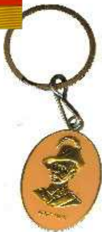
Key Rings $8