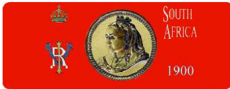
Queen Victoria Chocolate Tin $25 It is 204mm X 60mm X 26mm and contains 8 slouch hat chocolates and a brief history of the slouch hat in the Boer War