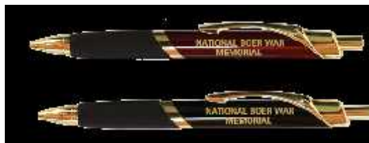
Pens— Black & Gold $10 each