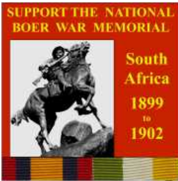
Vinyl Car Sticker 10mm X 10mm, $2.00 ea.

WHEN ORDERING PLEASE USE FORM ON NEXT PAGE AND COMPLETE ALL DETAILS