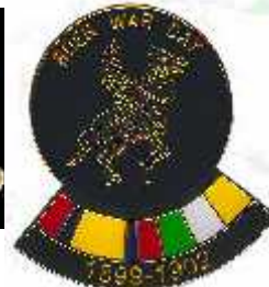
Boer War Day Badge $8