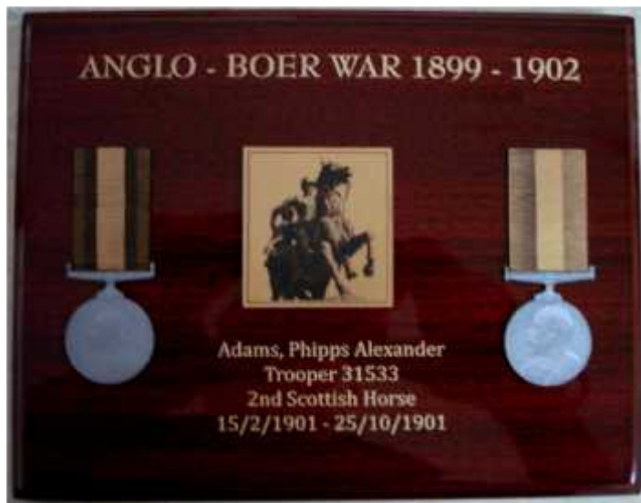
Attractive Wooden Plaque:: Please provide details below. The central motif can be replaced with a photo or a badge if arranged when ordering. Price $60 (+ $15 if photo used). Phone 03 98902465 for more details and order form.