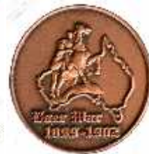
Metal Lapel Pin 25mm $2