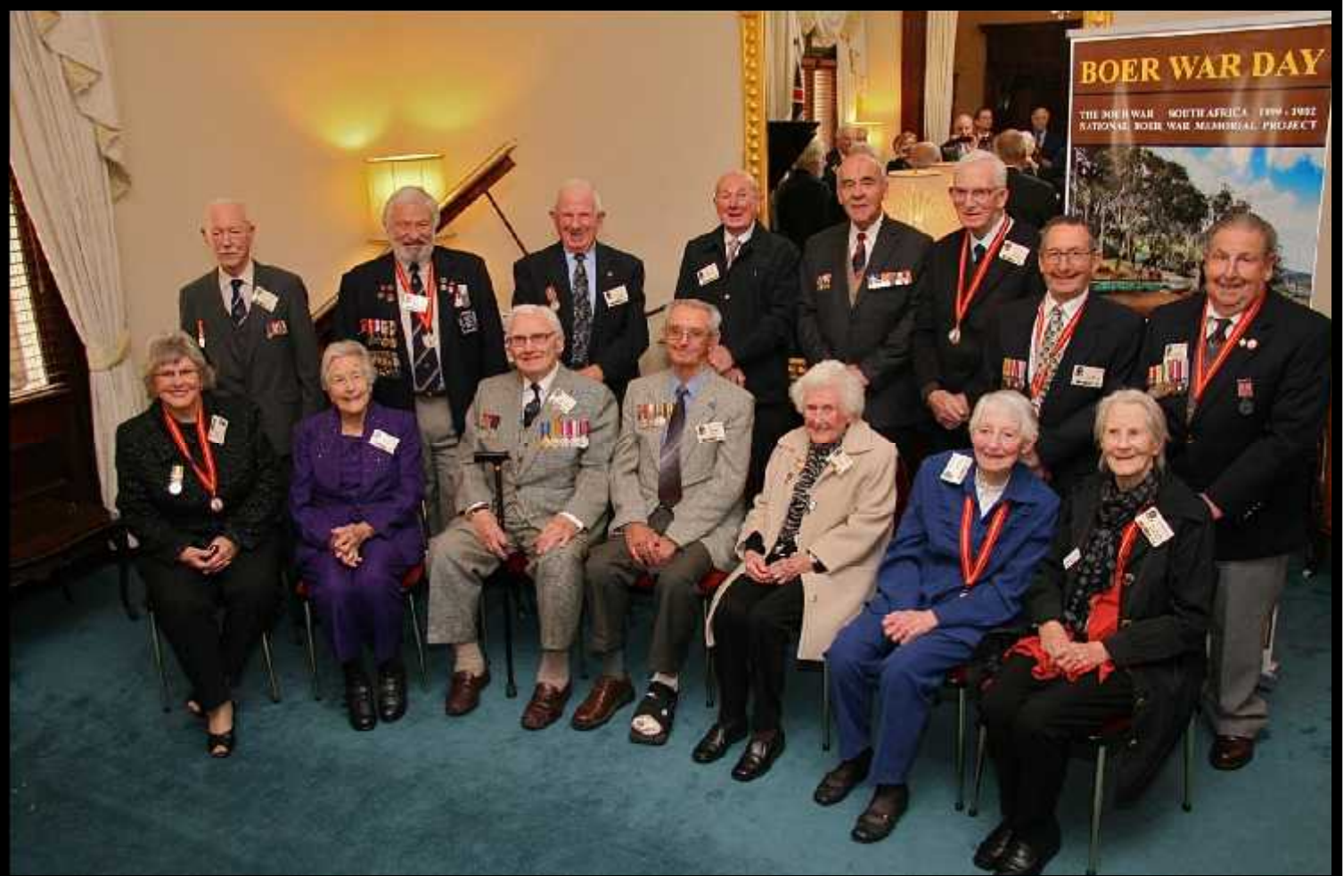
First generation descendants of Boer War veterans who attended the Civic reception at the Melbourne Town Hall on Wednesday 22nd May 2013.