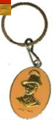
Key Rings $8