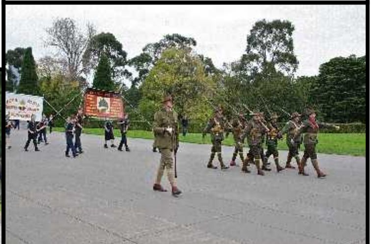
Australian Great War Association members who provided the Catafalque Party