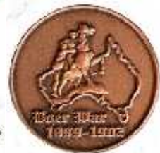
Metal Lapel Pin 25mm $2