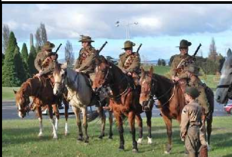
A section of the Tasmanian Light Horse preparing for the ceremony

At 11 am the march commenced and at the Shrine a Military Officer gave a speech about the Boer War. Various other dignitaries spoke about giving thanks to the soldiers who lost their lives fighting in the war. There was also discussion about creating a permanent Memorial on Anzac Parade in Canberra. After all the speeches they played God Save The Queen, the National Anthem and the Last Post which we all saluted. Then the cannon was fired three times. This was very loud but looked awesome. Overall it was a great day."