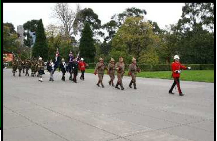
Re-enactment Association members and the NBWMA Flag Party

With its 2013 theme the epic Defence of Elands River the day's Commemoration Service had special interest. The march was led by the Creswick Light Horse and the Victoria Police Pipe Band.