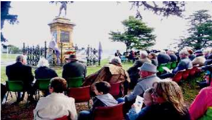
Tasmanians respond in Hobart on Boer War Day

Tasmanians turned out in force attending their Commemoration which was held over two weekends—Sunday 3 June in Hobart and Sunday 10 June in Launceston.