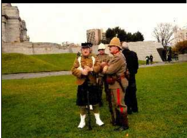
Boer War 'veterans' discuss the campaign at the Shrine of Remembrance on Sunday 27 May 2012