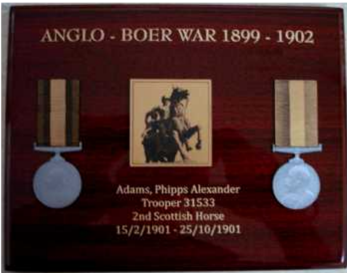
Attractive Wooden Plaque: Please provide details below. The central motif can be replaced with a photo or a badge if arranged when ordering. Price $60 (+ $15 if photo used). Phone 03 98902465 for more details and order form.