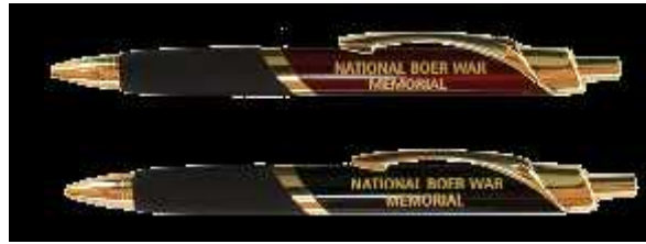
Pens —Maroon & Gold or Black & Gold $10 each