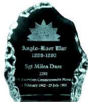
Clear Crystal Glass Memorial—Laser Etched 130mm X 155mm X 30mm....Weight 880 grams In lined presentation case. (Image has been shown with dark background to highlight engraving. Please provide details below with order. Can be supplied without badge or with the April 1902 pattern ACH Badge instead of that shown. $120 +PP&I $22 in Victoria (may be slightly higher in other States).