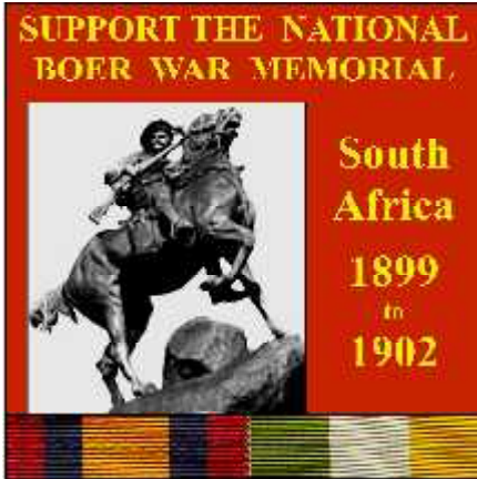
Vinyl Car Sticker 10mm X 10mm, $2.00 ea.