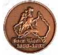
Metal Lapel Pin 25mm Diam $2 each

WHEN ORDERING PLEASE USE FORM ON NEXT PAGE AND COMPLETE ALL DETAILS