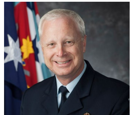
Air Chief Marshal Mark Binskin AC, Chief of the Defence Force and National Patron - National Boer War Memorial Fund

"I wish you well for the 2015 commemorations as we recognize