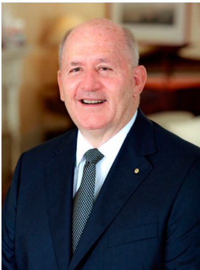
His Excellency General the Honourable Sir Peter Cosgrove AK MC (Retd) Governor-General of the Commonwealth of Australia

"The Boer War is significant in our military history and to our nation's development.