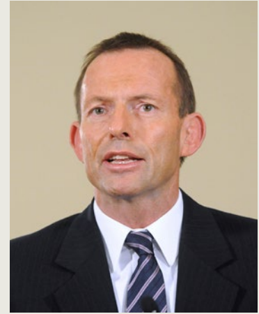
The Hon Tony Abbott MP, Prime Minister