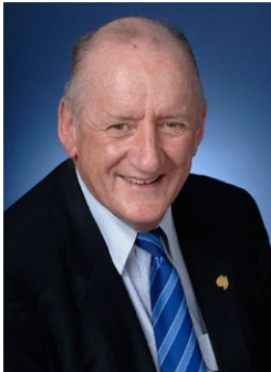
The Hon Tim Fischer AC, current Patron of the National Boer War Memorial Fund.

Our Fund Patron, the Hon Tim Fischer AC, has highlighted the very real need for completion of Australia's first National Boer War Memorial in a statement he has signed simply "2Lt Tim Fischer AC Retd" drawing attention to the role of Boer War veterans in the Gallipoli campaign.