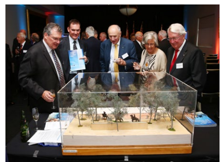
Supporters at the February 5 function took a keen interest in a scale model of the Memorial.