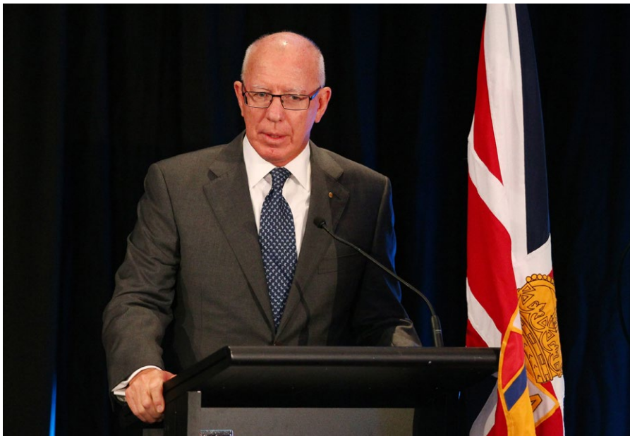
The Hon David Hurley, previously National Patron of the National Boer War Memorial Association, now Governor of NSW.