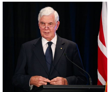
A key speaker at the February 5 launch was Major General the Hon Michael Jeffery AC AO (Mil) CVO MC (Retd).