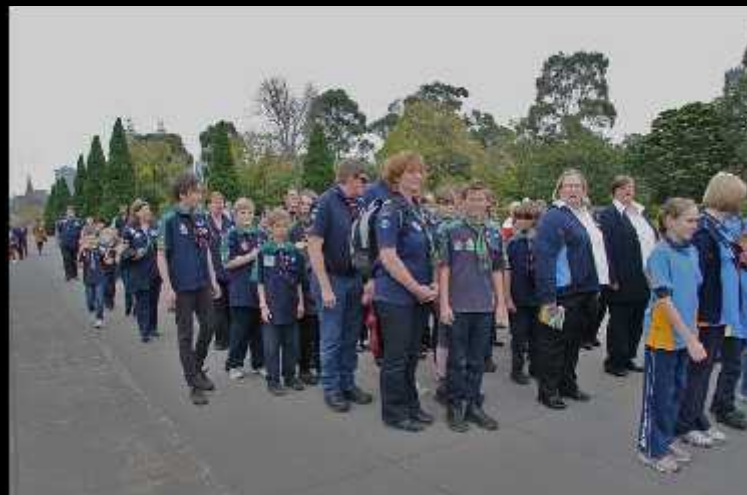
A section of the 95 scouts and guides who attended and assisted on the day. The Boer War was the genesis of the scouting movement and is very much part of its heritage. It was great to see such a turn up of scouts and guides. A certificate is to be issued to all who attended in uniform.