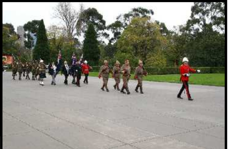
Re-enactment Association members and the NBWMA Flag Party

With its 2013 theme the epic Defence of Elands River the day's Commemoration Service had special interest. The march was led by the Creswick Light Horse and the Victoria Police Pipe Band.