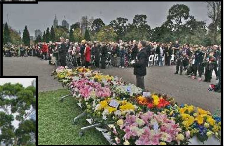
An important part of the service is the laying of wreaths and nearly twenty were laid by various organisations and individuals