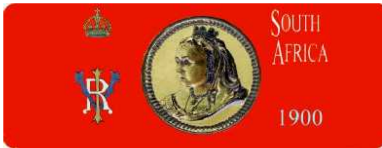
Queen Victoria Chocolate Tin $25 It is 204mm X 60mm X 26mm and contains 8 slouch hat chocolates and a brief history of the slouch hat in the Boer War