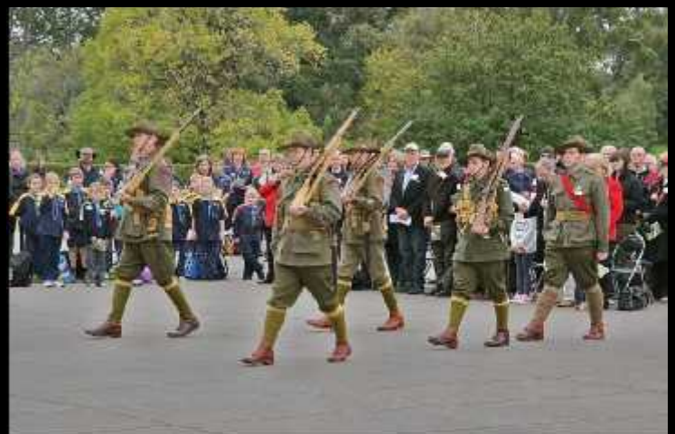
The Catafalque Party move into position at the commencement of the service