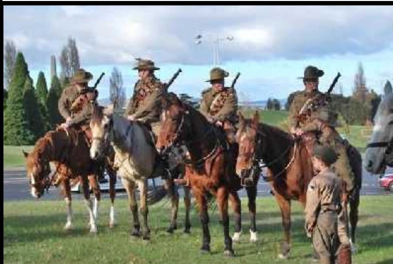
A section of the Tasmanian Light Horse preparing for the ceremony

At 11 am the march commenced and at the Shrine a Military Officer gave a speech about the Boer War. Various other dignitaries spoke about giving thanks to the soldiers who lost their lives fighting in the war. There was also discussion about creating a permanent Memorial on Anzac Parade in Canberra. After all the speeches they played God Save The Queen, the National Anthem and the Last Post which we all saluted. Then the cannon was fired three times. This was very loud but looked awesome. Overall it was a great day."