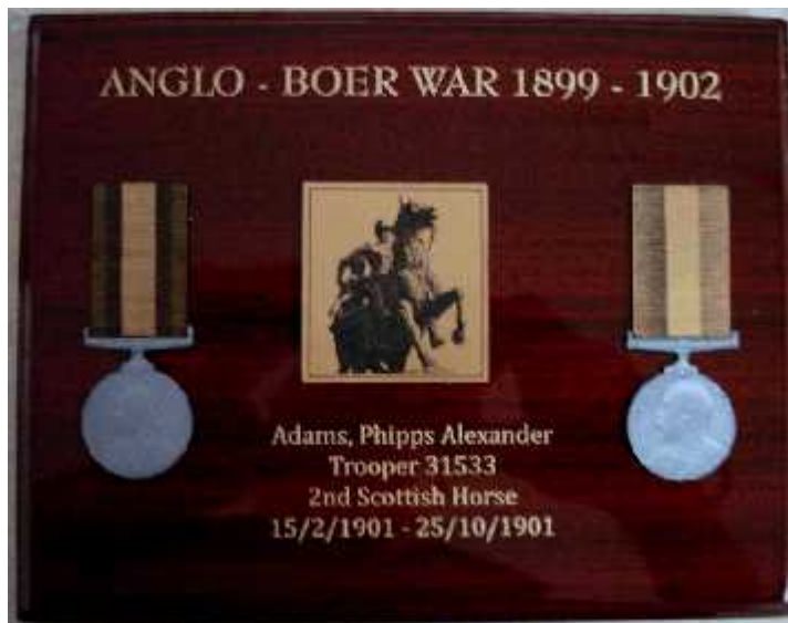
Attractive Wooden Plaque :: Please provide details below. The central motif can be replaced with a photo or a badge if arranged when ordering. Price $60 (+ $15 if photo used). Phone 03 98902465 for more details and order form.