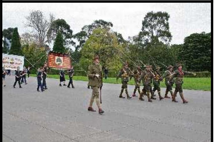
Australian Great War Association members who provided the Catafalque Party