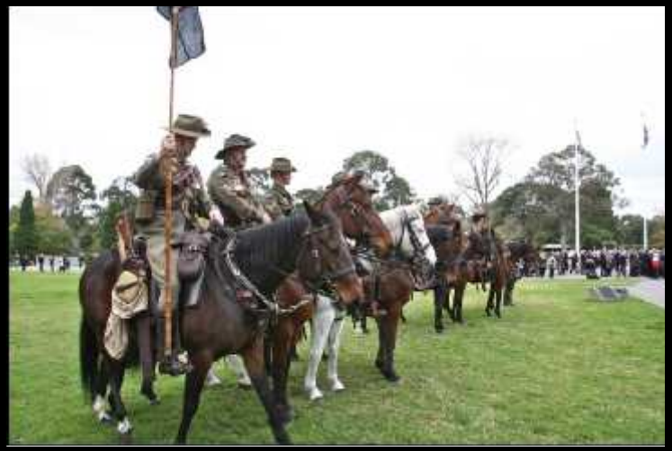
The Creswick Light Horse take up their position alongside the Eternal Flame