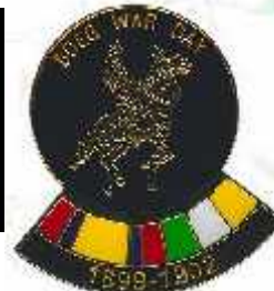
Boer War Day Badge $8