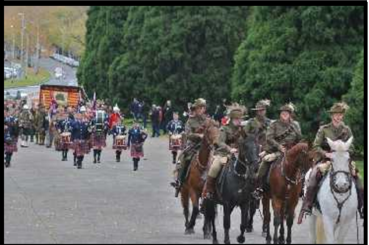
Creswick Light Horse and Pipe Band