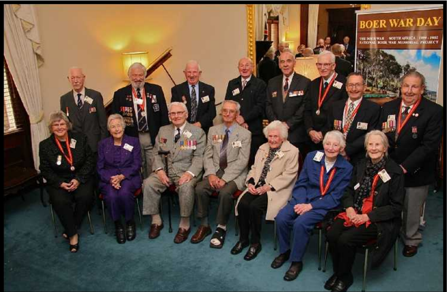
First generation descendants of Boer War veterans who attended the Civic reception at the Melbourne Town Hall on Wednesday 22nd May 2013.