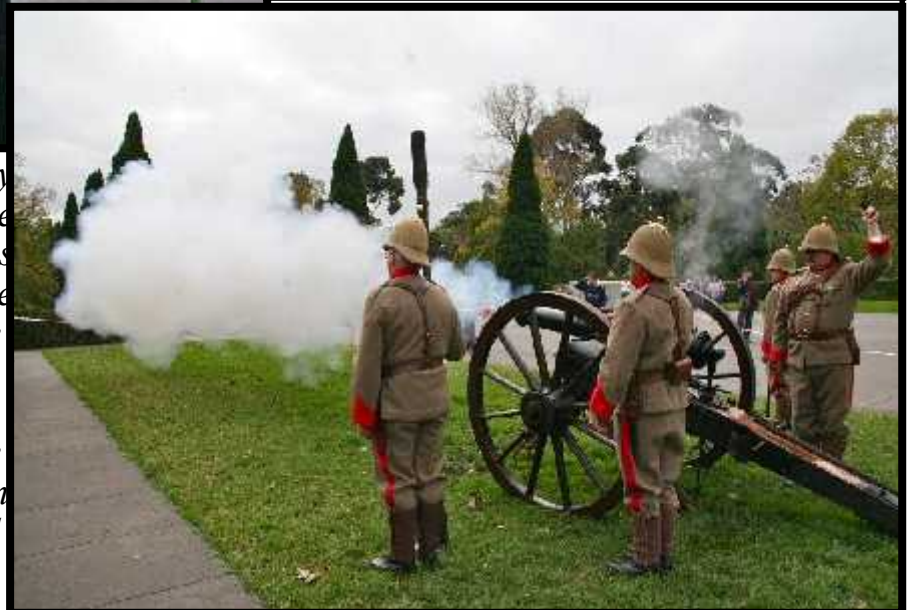
Day siege against impossible odds when they had long been given up for lost. It was a proud day for Australia and should never be forgotten.