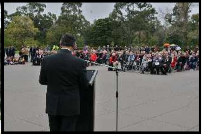
A section of the crowd at this this year's service