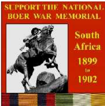
Vinyl Car Sticker 10mm X 10mm, $2.00 ea.

WHEN ORDERING PLEASE USE FORM ON NEXT PAGE AND COMPLETE ALL DETAILS