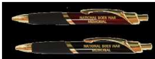
Pens — Black & Gold $10 each