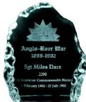
Clear Crystal Glass Memorial—Laser Etched 130mm X 155mm X 30mm....Weight 880 grams In lined presentation case. (Image has been shown with dark background to highlight engraving. Please provide details below with order. Can be supplied without badge or with the April 1902 pattern ACH Badge instead of that shown. $120 +PP&I $22 in Victoria (may be slightly higher in other States).