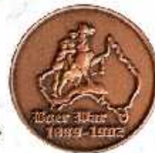
Metal Lapel Pin 25mm $2