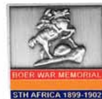
Lapel Pin $10.00 25 x 25 mm