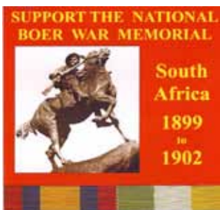
Car Sticker $2.00 (10cm x 10cm)

To promote the Association and assist in fund raising, the following items are available for purchase. Contact the Secretary at the above address. Please add $2.50 for postage of badges, $1 for sticker only.