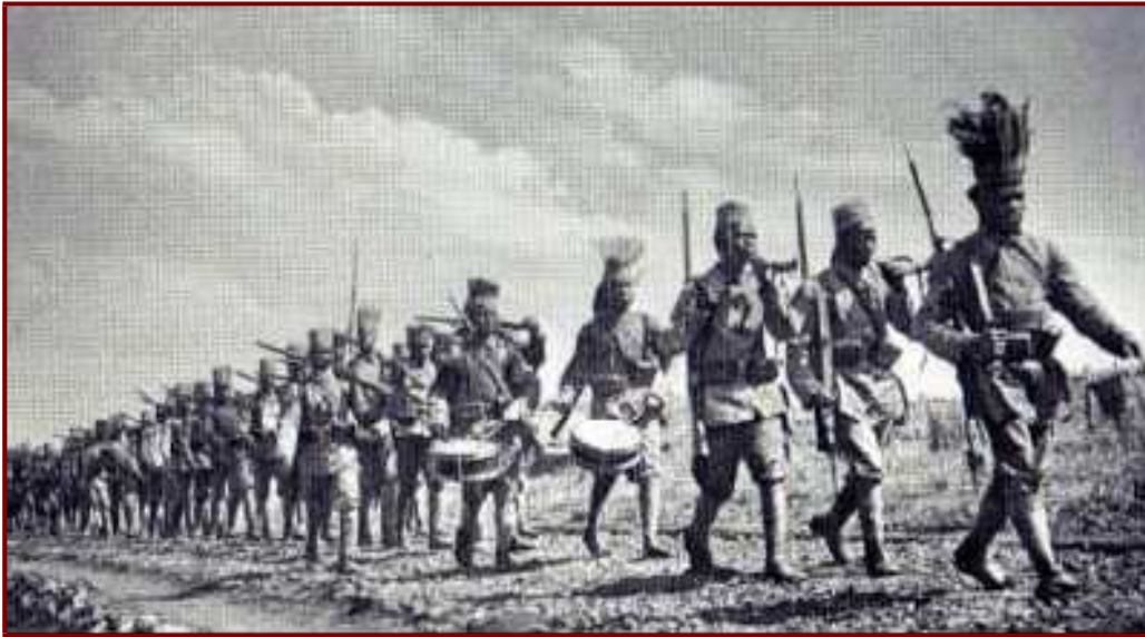
Above: German Schutztruppe marches through Portuguese East Africa.

possible without alerting the enemy. Most supplies were carried from the nearest railhead on African porters' heads and there were never enough porters as their work was hard and dangerous. The tsetse fly also killed a massive number of British animals. During 1916 the British lost many thousands of horses, whilst oxen and mules in tsetse fly areas were expected to live only six weeks. The animals died from disease, overwork and from lack of proper fodder and oats. The Scouts themselves regularly contracted malaria, and health conditions were so bad that for every British soldier killed ten others needed hospitalisation for tropical diseases. During the last four months of 1916 around 12,000 white troops were medically evacuated to South Africa, seriously weakening the strength of the British forces in East Africa.