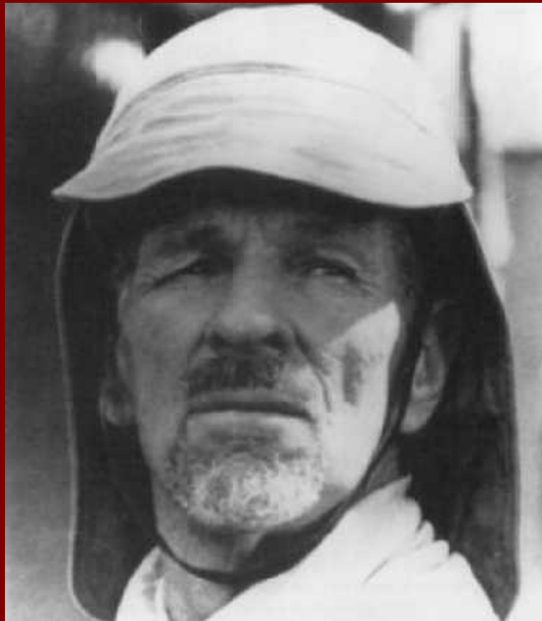
The last photograph of Arnold Wienholt, taken shortly before he was killed