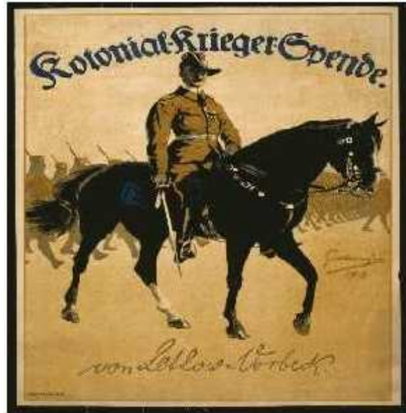
Above: Oberst Paul von Lettow-Vorbeck, commander of the German Troops in German East Africa