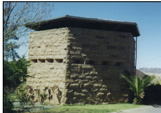
Hexagonal pattern Blockhouse Aliwal North (Dewetsville)

In the end there were over 8 000 blockhouses of all different types constructed during the war. Some 50 000 men were deployed to guard all the blockhouses. The length of blockhouse lines covered up to 6 000 KM. The whole cost of erecting the blockhouses with all their entanglements, was over £1 000 000. Gen de Wet called Kitchener's blockhouse system the blockhead system.