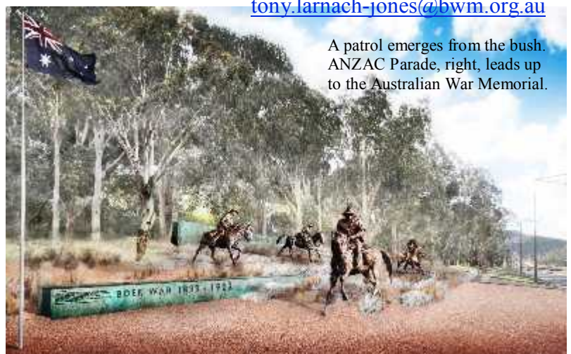
A patrol emerges from the bush. ANZAC Parade, right, leads up to the Australian War Memorial.

Feature Article: The national Boer War memorial DESIGN ! See centrespread