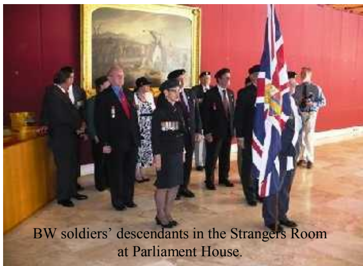
BW soldiers' descendants in the Strangers Room at Parliament House.