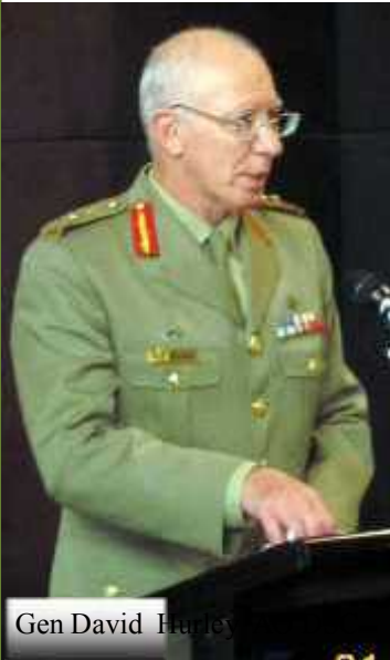
Gen David Hurley

General David Hurley AO DSC , Chief of the Defence Force, unveiled the national Boer War Memorial design at the Military Offices, Canberra on Thursday 1 March 2012.