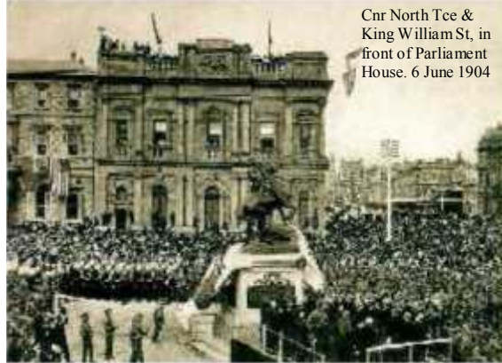
Cnr North Tee & King William St, in front of Parliament House. 6 June 1904