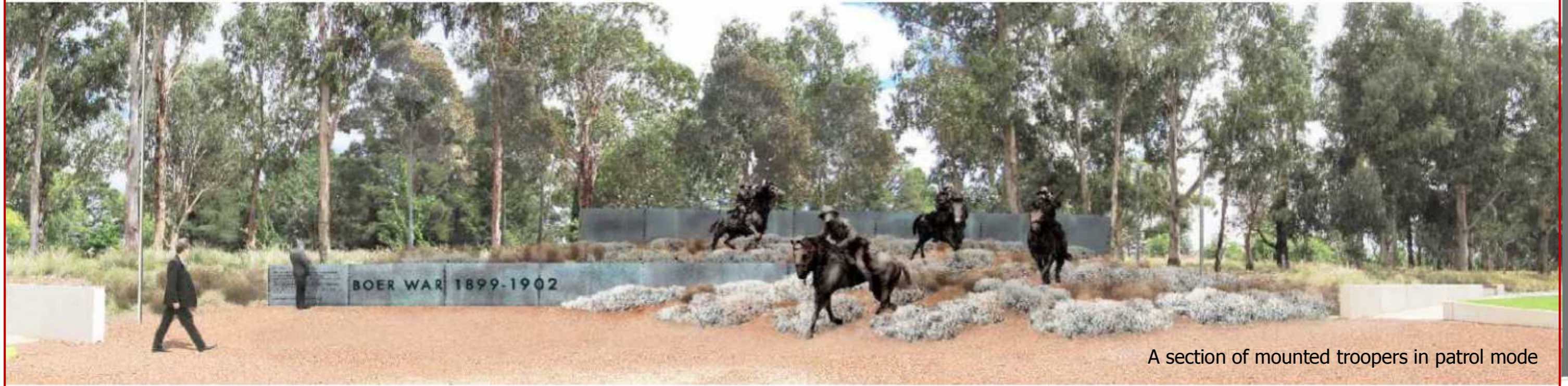
A section of mounted troopers in patrol mode